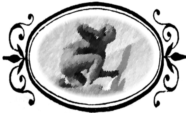
The Little Dutch Boy

The trouble with Darwin's theory is that it does not predict well, but there is trouble with prediction itself. In an old story a little Dutch boy wanders one day along one of the dikes that holds back the sea from his native land. By the sheerest chance he passes a small but dangerous leak in the dike. Seeing the threat to his lowland nation the boy plunges his finger into the hole, stopping the flow. He remains stalwartly in place until adults find him, gratefully relieve him, and effect the necessary repairs to the dike. The boy's heroism is then sung throughout the land, for if he had not found the leak and performed his digital act the dike would have breached and the nation drowned. 2